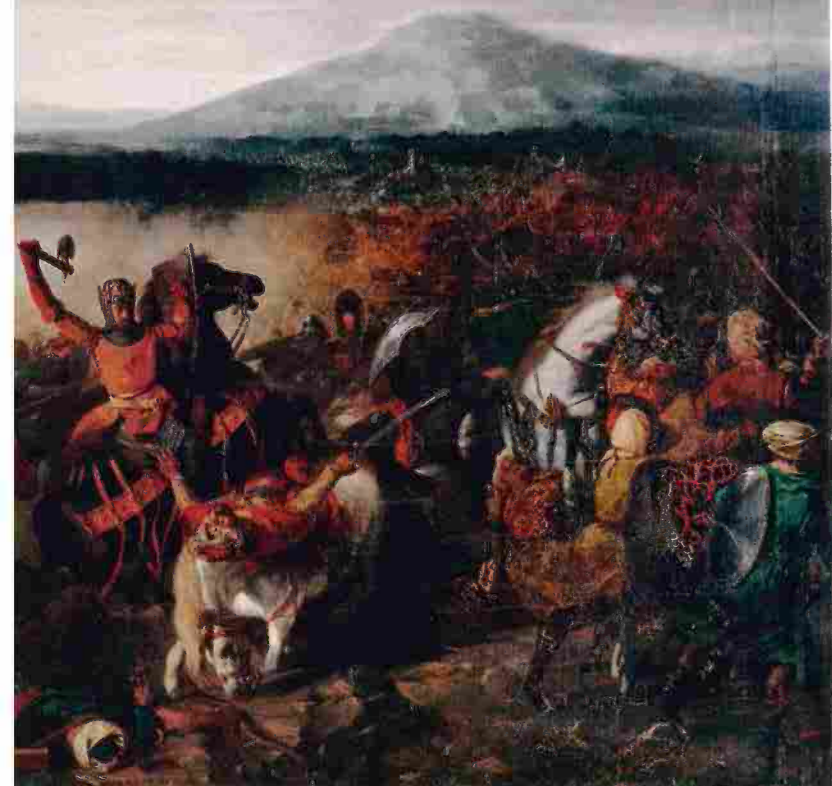
A painting shows Roger I fighting Muslim forces at Cerami. Victory here would make the Normans the dominant force on the island of Sicily