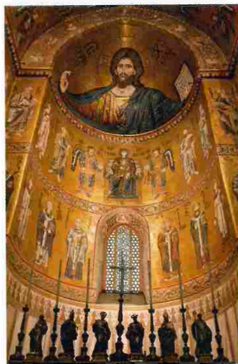
Christ Pantocrator towers over an array of saints, including Thomas Becket, in the main apse of Palermo's Monreale Cathedral

Monreale was not the only place in Sicily to honour Saint Thomas. The cathedral in the town of Marsala at the island's western tip was also dedicated to him – his statue still adorns the front exterior.