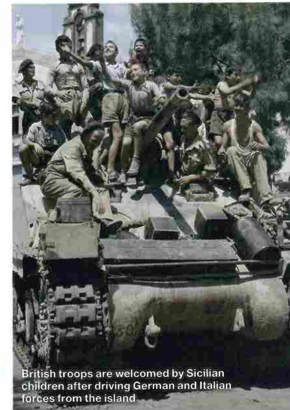
British troops are welcomed by Sicilian children after driving German and Italian forces from the island